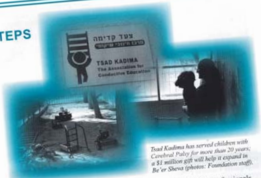
Tsad Kadima has served children with Cerebral Palsy for more than 20 years; a $1 million gift will help it expand in Be'er Sheva.

Tsad Kadima has been working for two decades to spread the Peto Method in Israel, which it now does through five locations serving more than 300 children annually. To mark its 20th anniversary, last year it held an international conference for